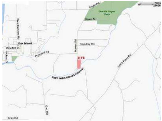
Anahuac Area 2