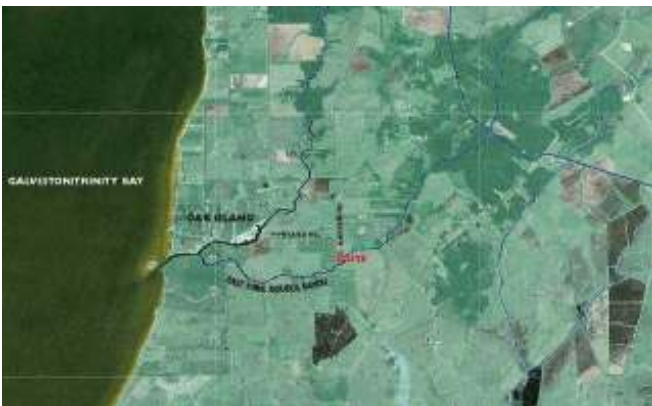
Anahuac Satellite 2