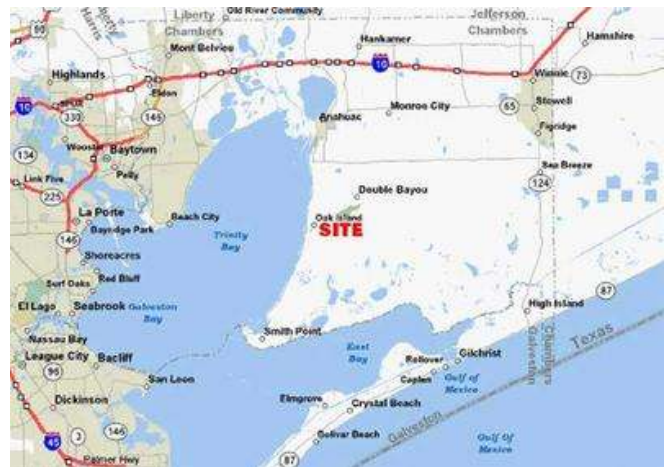
Anahuac Area 3