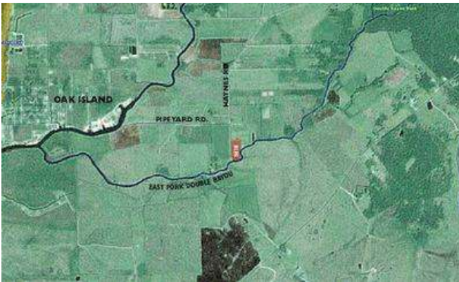
Anahuac Satellite 1