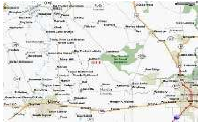
Hardin Area 1