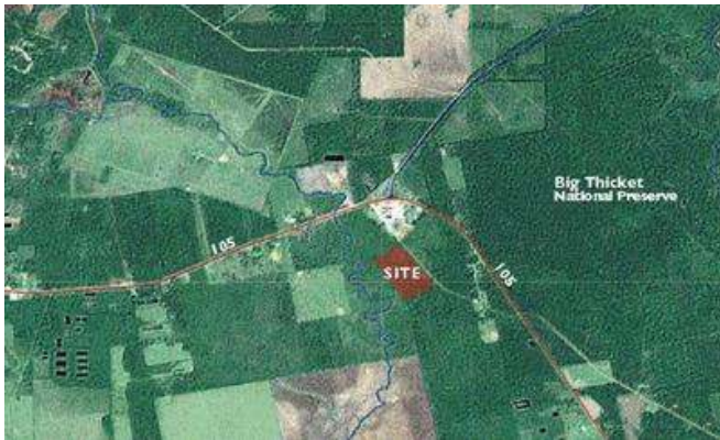
Hardin Satellite 1