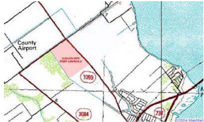
Tract 2 TOPO Map