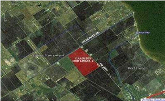
Tract 2 Satellite Map