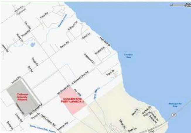
Tract 2 Area Map