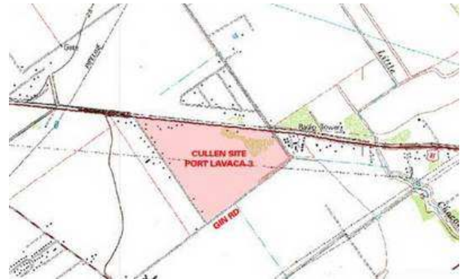
Tract 3 Area Map