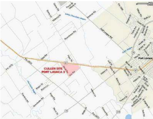
Tract 3 Area Map