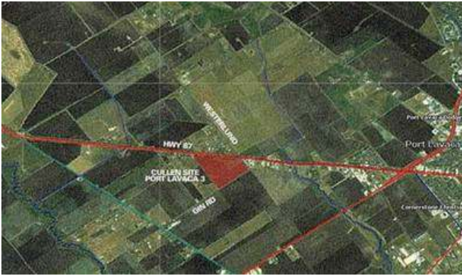
Tract 3 Satellite Map