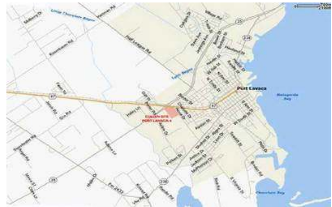
Tract 4 Area Map