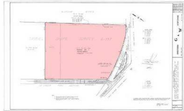
Tract 4 Survey Map