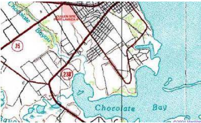
Tract 4 TOPO Map