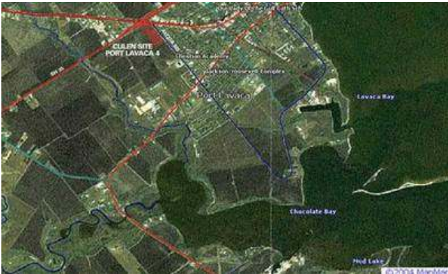
Tract 4 Satellite Map