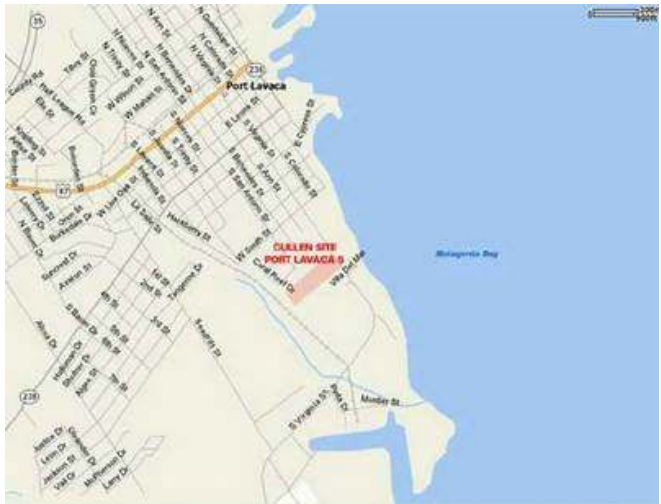
Tract 5 Area Map