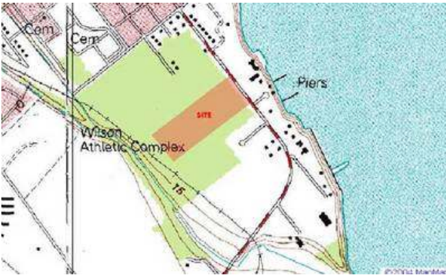
Tract 5 TOPO Map