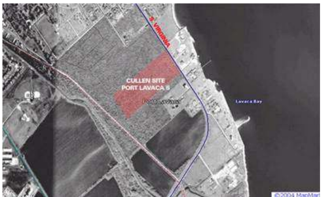
Tract 5 Satellite Map